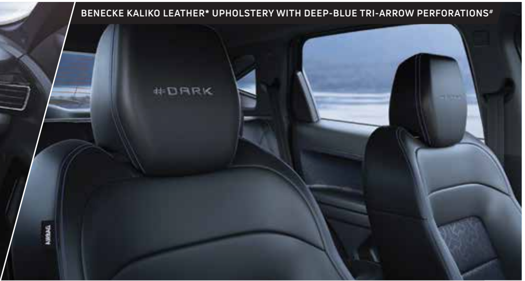
BENECKE KALIKO LEATHER* UPHOLSTERY WITH DEEP-BLUE TRI-ARROW PERFORATIONS#