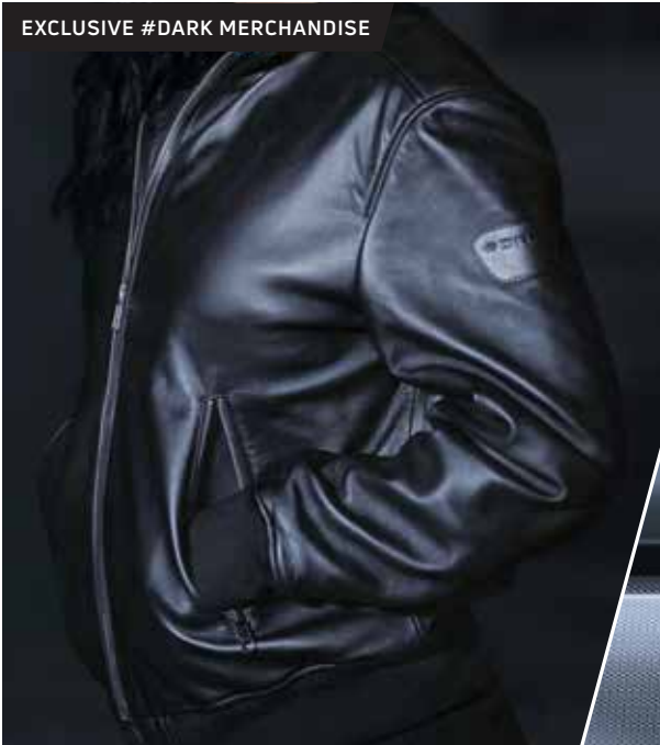
EXCLUSIVE #DARK MERCHANDISE