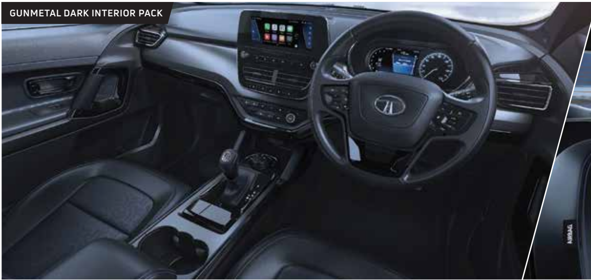
GUNMETAL DARK INTERIOR PACK