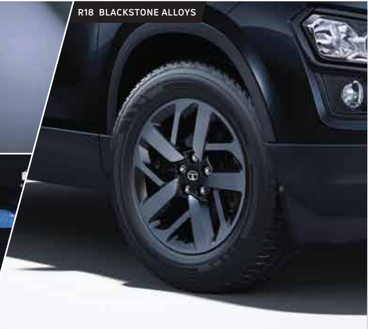
R18 BLACKSTONE ALLOYS