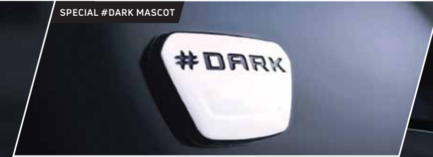
SPECIAL #DARK MASCOT