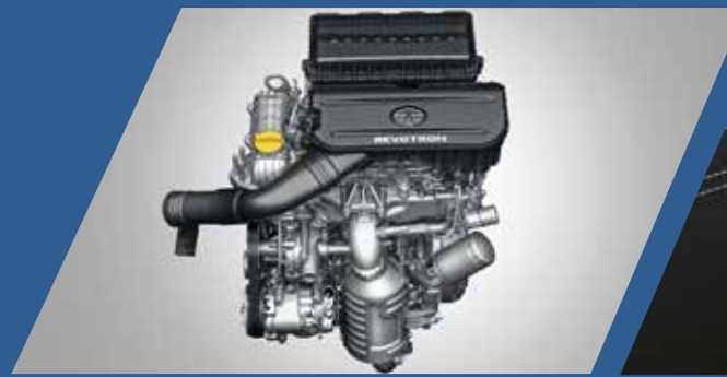
Max Power-86 ps @ 6000 r/min

Who says a peppy drive can't be thrilling? The Advanced AMT Transmission of Tiago lets you zip through any road without shifting a gear. The 1.2 L Revotron BS6 petrol engine with the power of 86 ps @ 6000 r/min gives you an all-round performance.