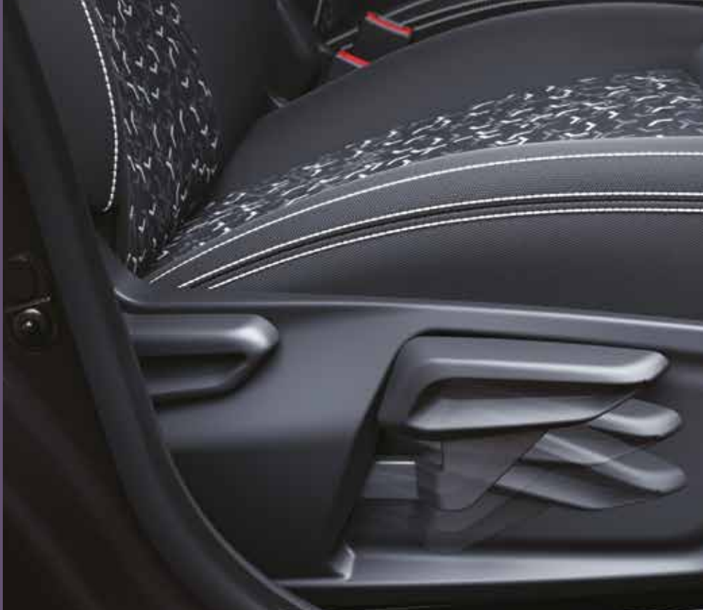
Height Adjustable Driver Seat