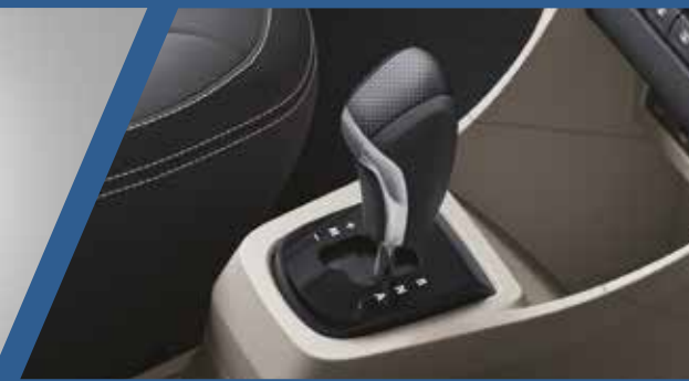
Advance AMT Transmission