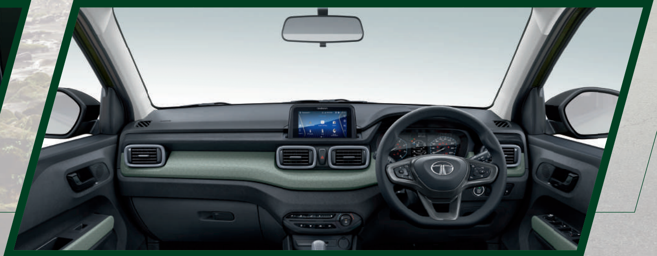
Tri-arrow themed dashboard with Military Green colour