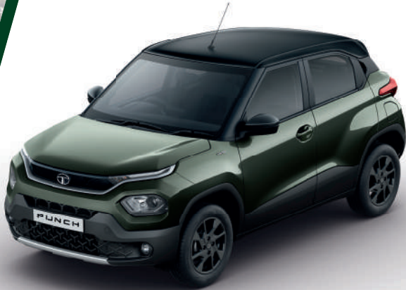
Foliage Green dual tone exterior with contrast of Piano Black or Pristine White roof