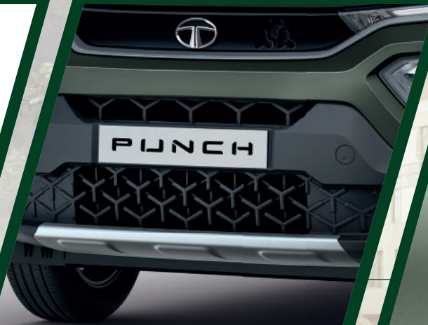
Stylish Gun metal Skid Plate*