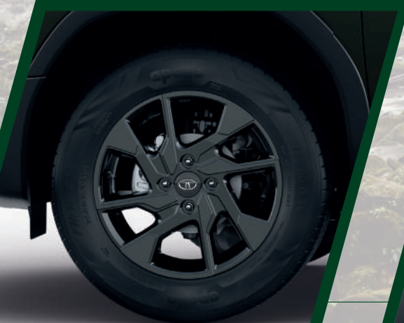
R16 Charcoal Alloys that spin towards infinity