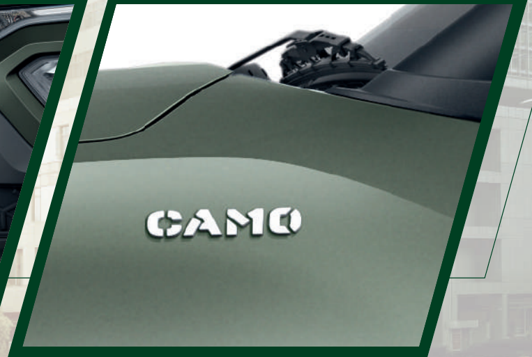
CAMO mascot on the fender